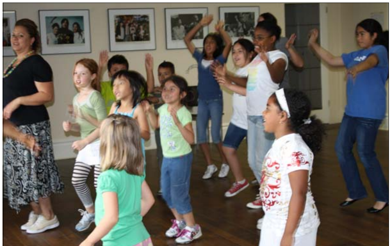
Students in the After School Program participate in Zumba dance classes once a week learning both cultural dances and exercising.