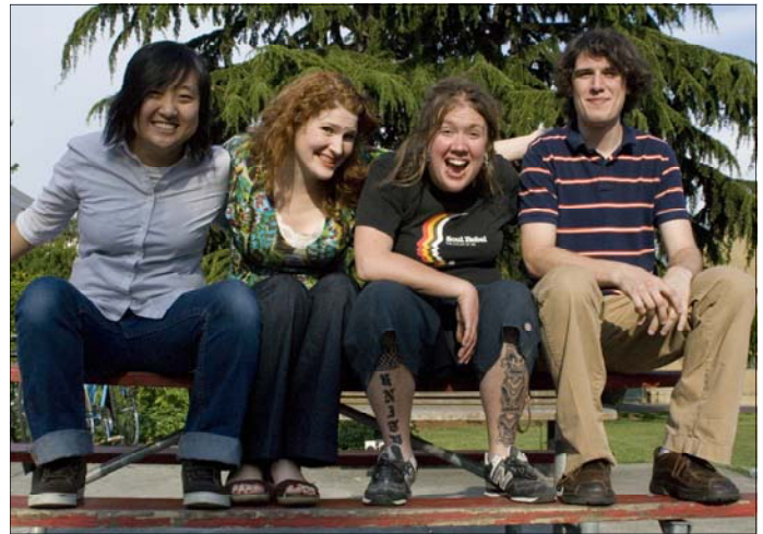
Gracias to photography volunteers from Seattle University who photographed El Centro programs and events this year. Their photos captured our mission in action. Mil gracias!