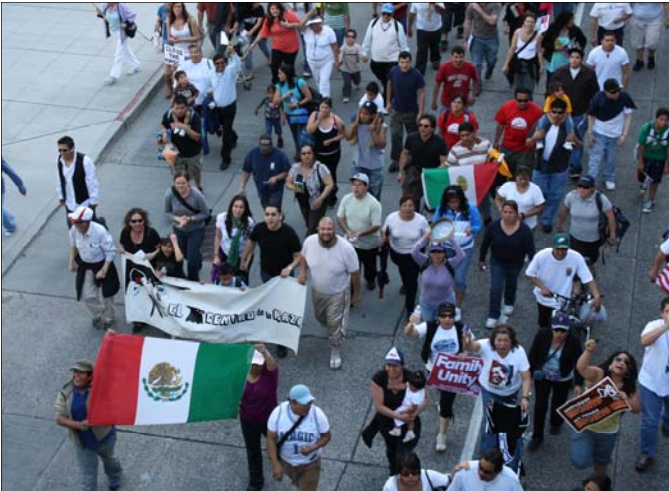
El Centro participates in the May Day rally and march for immigration and labor rights with over 1,000 supporters.