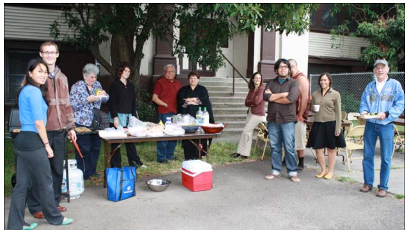
A volunteer appreciation BBQ to thank volunteers for all their hard work! El Centro was founded and operated for the first seven years by volunteer support. Mil gracias to all our volunteers!