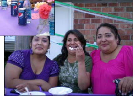
El Centro celebrates with residents of Rainbow Haven. We are working with the residents to keep their mobile homes as they face possible eviction by the City of Tukwila.