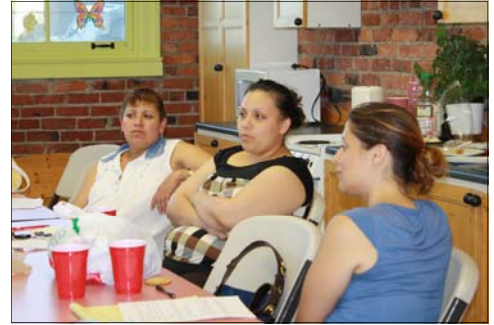
Comadres helps prevent isolation and provides opportunities for women to connect, network, build new relationships, relax, and find support in our community.