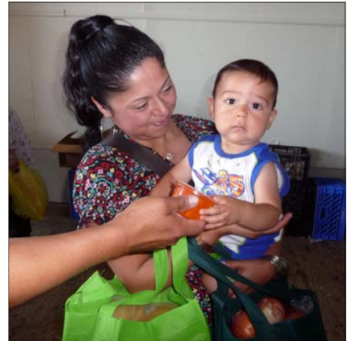
Stimulus funds present a unique opportunity to increase the capacity to serve low-income families while helping get people back to work and meeting the needs of families impacted by the recession.