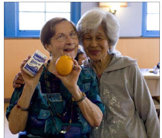
Additional funding from United Way allows El Centro to provide an additional hot meal per person to homebound seniors per week and an additional congregate meal per person per week.

meal onsite on Mondays for a total of five congregate meals per week, Monday-Friday. For more information about this program, please call 206.957.4643.