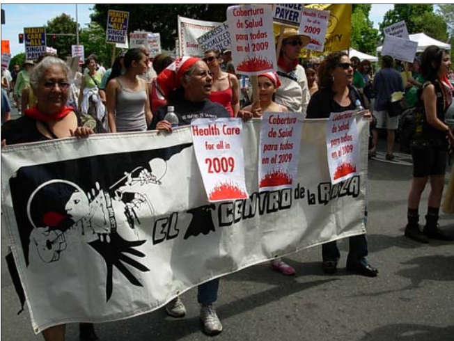
Mothers, children, volunteers, supporters and staff march and rally for healthcare in the May 30th Mother's March.