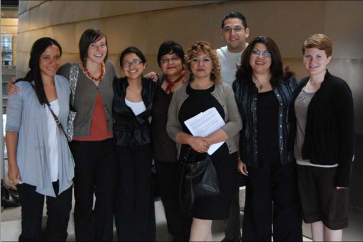
El Centro de la Raza community, staff and tenants testify at the Seattle City Council to keep the North Beacon Hill Neighborhood Plan on schedule to move forward for growth in the next 2-3 years.